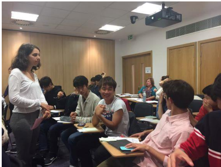
The culture and society lessons