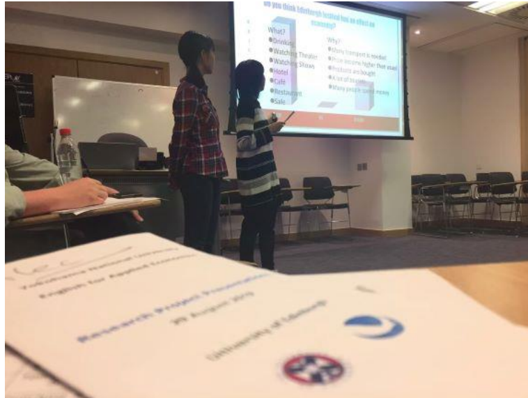
The economics lessons

found a difference of our culture, I found that we cannot decide which is right or not. The experiences to touch the foreign culture must be good for our breadth of insight.